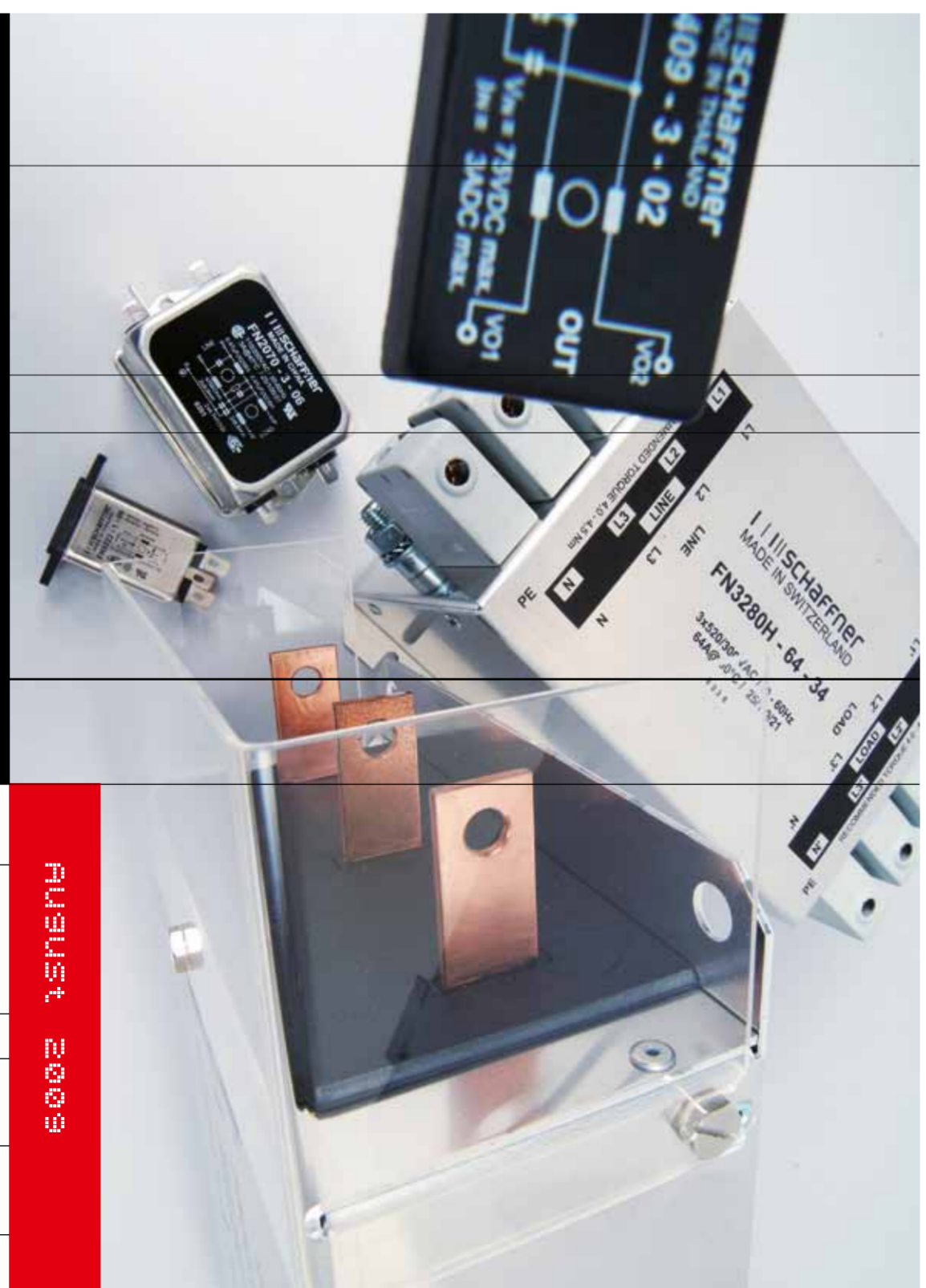
Product Range Overview

This document has been carefully checked. However, Schaffner does not assume any liability for errors or inaccuracies.